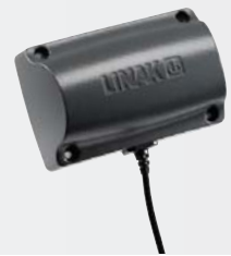
MD1 massage motor