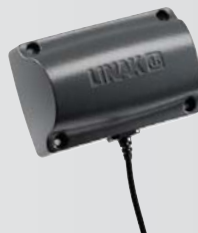
MD1 massage motor